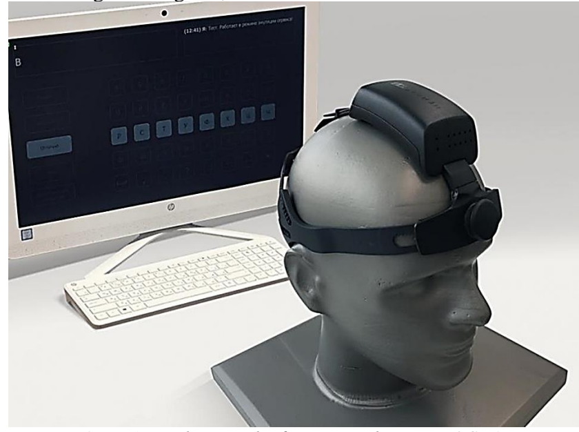
Figure 1. Hardware and software complex NEUROCHAT

NEUROCHAT — is a communication system that creates the possibility of network communication for people who are unable to speak and move. The hardware and software complex developed by Russian specialists is able to qualitatively improve the life of people with such diagnoses as infantile cerebral palsy, amyotrophic lateral sclerosis, stroke, multiple sclerosis and various types of neurotraumas [2]. The NEUROCHAT system consists of a headset capable of recording brain signals, as well as software installed on the user's computer.