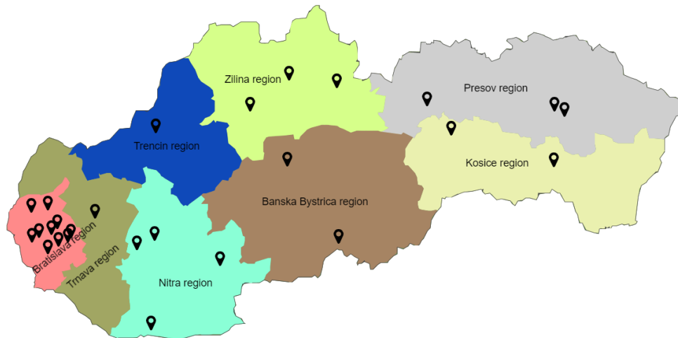
Picture 1. Coworking spaces across Slovakia

The history of the coworking spaces development in Slovakia has started 14 years ago. However, the new openings achieved pick in 2018. According to our research, we have identified 27 coworkings with available contact information. They are distributed across the whole of Slovakia (see picture 1) but the highest concentration is in Western Slovakia regions. Key characteristics of these spaces are presented in Table 1 (in attachments).